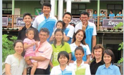
At a PanatNikom School, with Pastor and church members there

Please continue to pray for children in PanatNikom. This is a vital time for many as they decide whether or not to start learning more about Jesus.