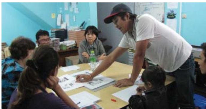
A Team meeting - sharing our articles for the Booklet