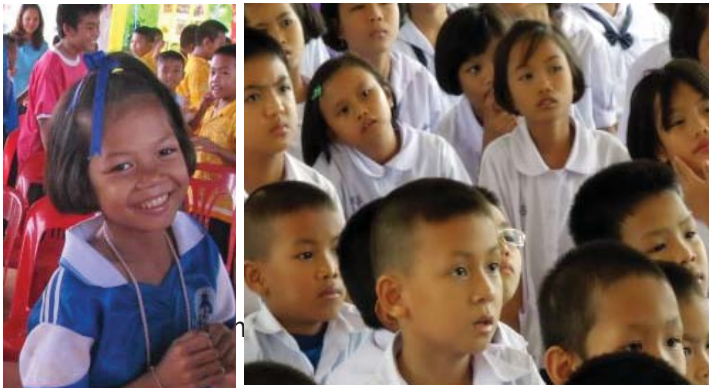
Varied reactions to our program in the schools